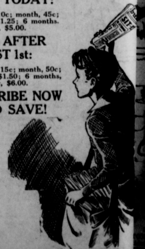
Each of these boys will appreciate any assistance that their patrons will give!

BEGINNING AUGUST 1, 1937, SUBSCRIPTION PRICE WILL BE 15c PER WEEK; 50c PER MONTH; $1.50 PER 3 MONTHS; $3 PER 6 MONTHS; $6 PER YEAR. Rates prevailing during this contest are 10 c per week; 45c per month; $1.25 per 3 months; $2.50 per 6 months; $5 per year. Subscribe now under these rates and save the difference. The paper is forced to ask this small amount increase because of increase in cost of paper, ink and other news paper supplies.