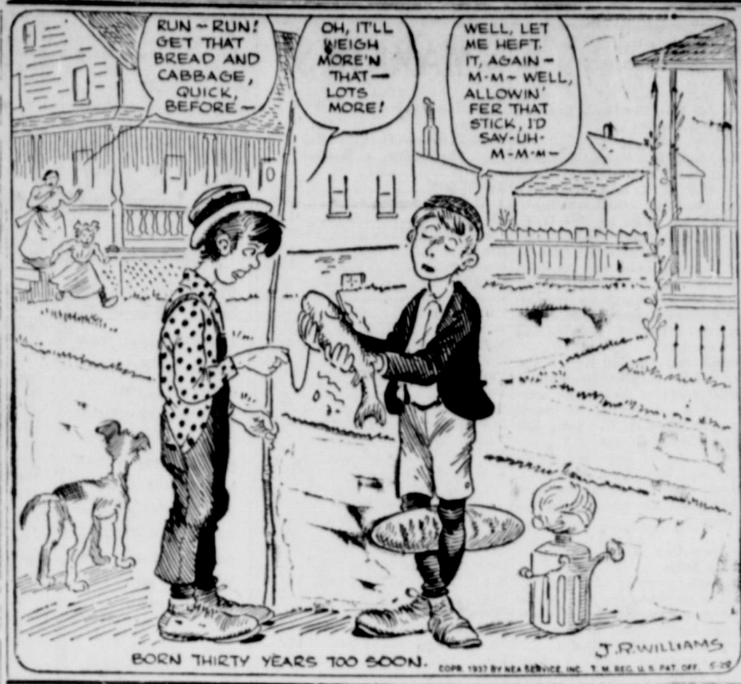
BORN THIRTY YEARS TOO SOON. 5-25