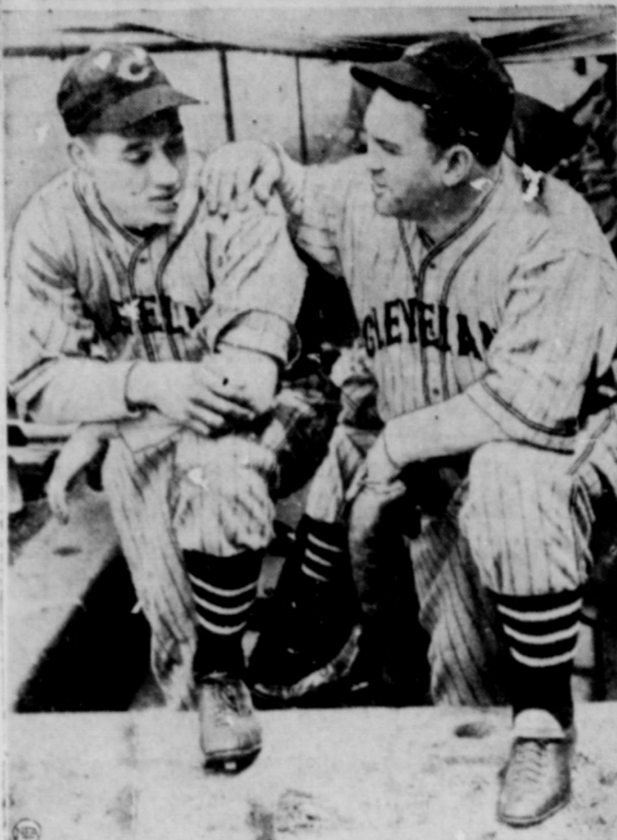
Bob Feller, left, is cast with the Cleveland Indians, ready to pitch again after being on the sidelines since April 24 with a stubborn sore arm. Here the phenomenal 18-year-old strikeout king talks things over with Manager Steve O'Neill.