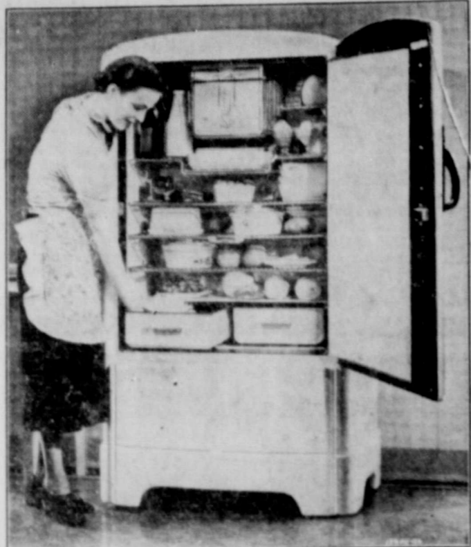
The "food guardian" which protects food from improper temperatures, the "food froster" which chills desserts in ivory overware pottery molds which can be used in the oven, twin vegetable fresheners, sliding shelves and twin interior lights for proper illumination are among the features of the 1937 Montgomery Ward refrigerator.

when Mr. Ragland became sick. The freezing temperature Saturday night was a surprise to many and as a result there were some frozen water pipes and broken car radiators.