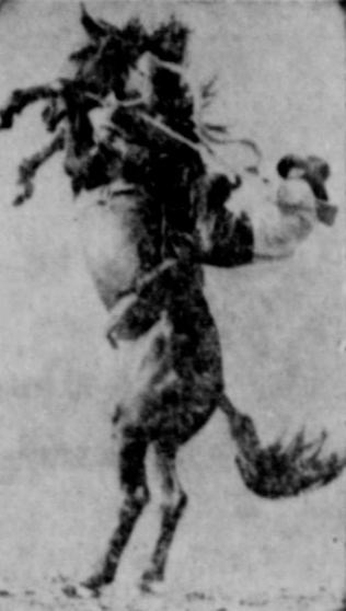
This is one of the 135 bucking horses to be used in the World Championship Rodeo at the World Western Exposition and Fat Stock Show in Fort Worth, March 12 to 21.