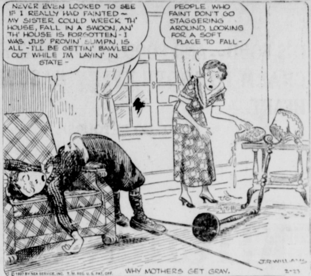
WHY MOTHERS GET GRAV...