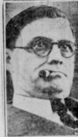
Gov. Eugene Talmadge