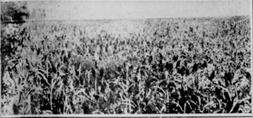
Remarkable success of the U. S. Soil Conservation Service in battling erosion and saving farm lands of the southwest ravaged by dust storms is strikingly shown in these contrast pictures.

975; mix- ing sows, 600-700- ows, 400- lves, 450- receipts 10; sheep.