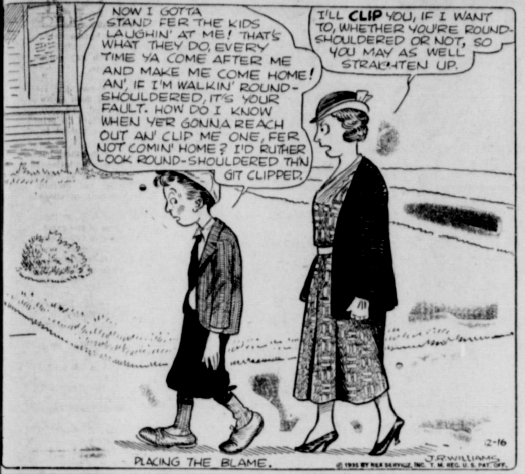
PLACING THE BLAME.