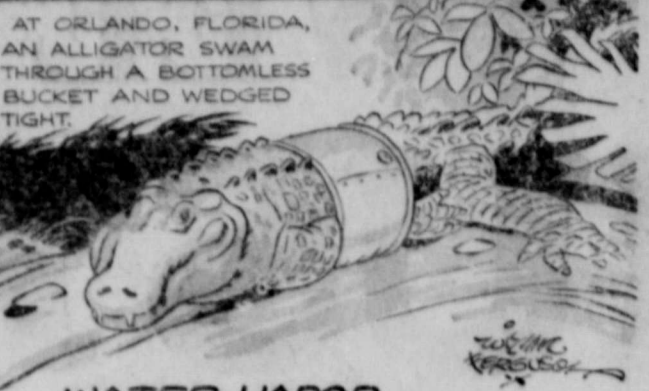
AT ORLANDO, FLORIDA, AN ALLIGATOR SWAM THROUGH A BOTTOMLESS BUCKET AND WEDGED TIGHT.