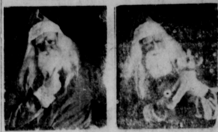
It's a job of many moods—this Santa Claus business, as these camera studies show. Taken on his visit to the Montgomery Ward toy shop, the pictures prove that Santa finds it necessary to give thoughtful attention to his work as well as to smile his usual jolly smile.