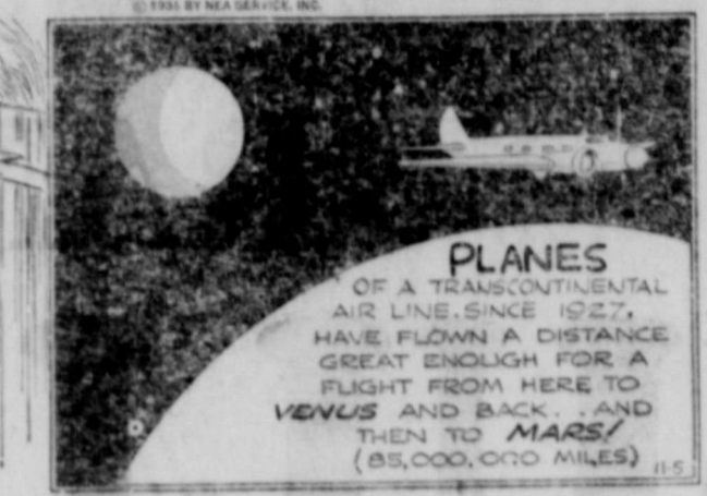
PLANES OF A TRANS-CONTINENTAL AIR LINE, SINCE 1927, HAVE FLOWN A DISTANCE GREAT ENOUGH FOR A FLIGHT FROM HERE TO VENUS AND BACK, AND THEN TO MARS! (85,000,000 MILES)

THE alligator a six-footer that tried to swim through a bottomless bucket paid for the experience with its life. It had become more helpless, apparently, as it struggled to get free from the curious contraption, which pinned its forelegs to its sides.