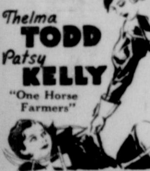
Thelma TODD Patsy KELLY "One Horse Farmers"

DUKE ELLINGTON and His Band in "Symphony in Black"