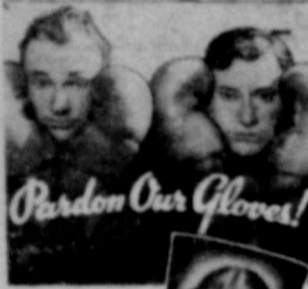
Pardon Our Gloves! The lovely-to-look-at boys on the ropes in this yarn of two battles in society.

Two Fisted A Paramount Picture with LEE TRACY - ROSCOE KARNS GAIL PATRICK KENT TAYLOR Grace Bradley - Billy Lee