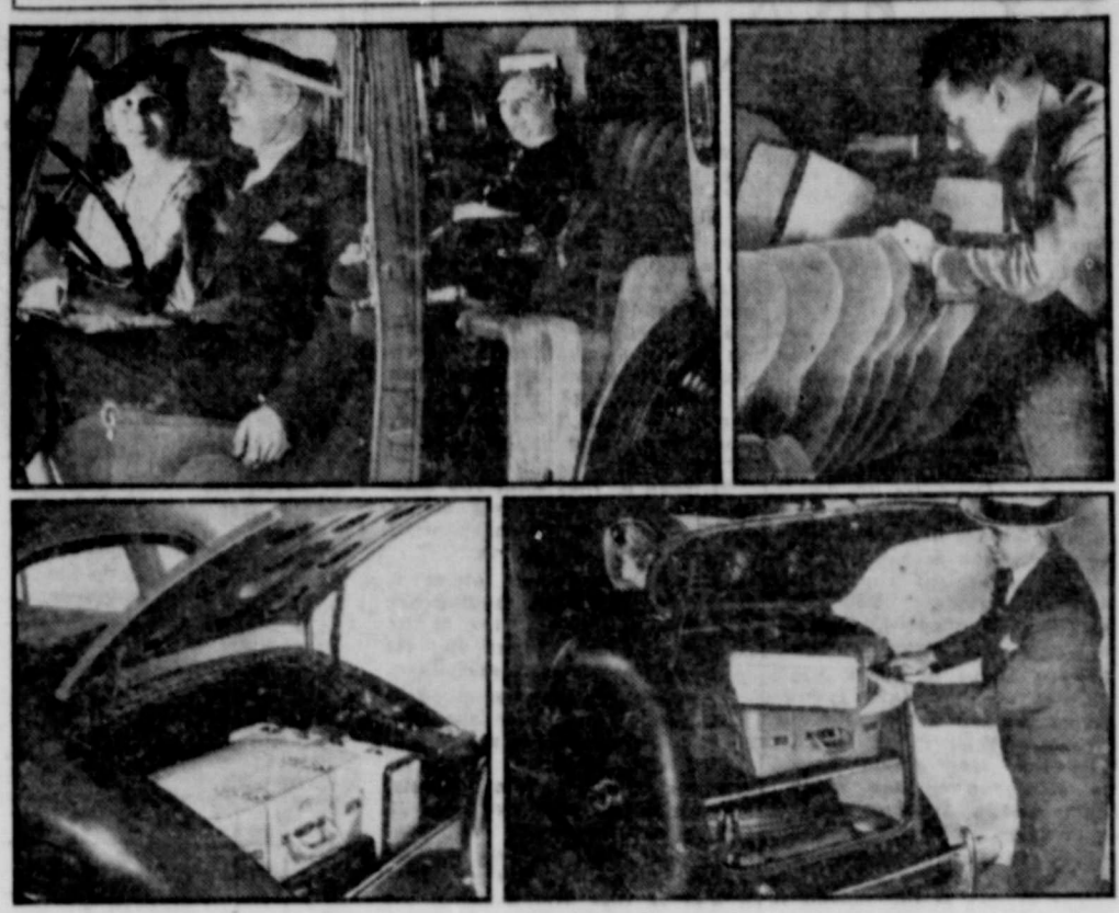
Comfort, pleasure, and safety on a tour depend largely on efficient loading of the luggage, and modern body designs have done much to ease the problem, as these views of Chevrolet models reveal. In the upper left view, the suitcases have been fitted in snugly, the adjustable front seat having been moved forward to allow extra leeway, and the driver is now pushing back the seat to clamp the bags in place for the day. Upper right, the tourist is utilizing the baggage space back of the rear seat. The two lower pictures show the loading of a coupe compartment and a sedan trunk.