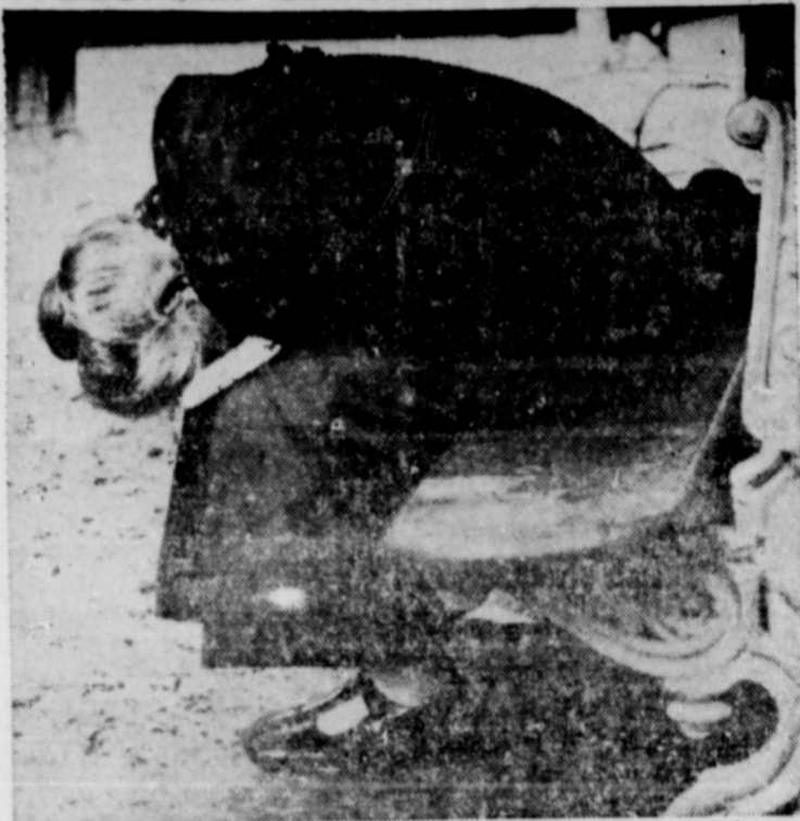
This picture, taken on what was once one of the most famous streets in the world, depicts the despair which now replaces its former gaiety. To alleviate despair and suffering is the objective of the French Relief Fund and other United Nations member agencies of the National War Fund.