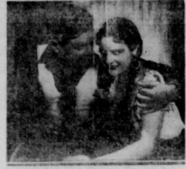
Richard Dix and Maria Alba in EKO-Radio's "West of the Pecos," a romantic story of the Southwest in the days when the gun was the law and life was a dangerous pastime. The fast-moving story is from the novel by Zane Grey. Now showing at the Arcadia Theatre.