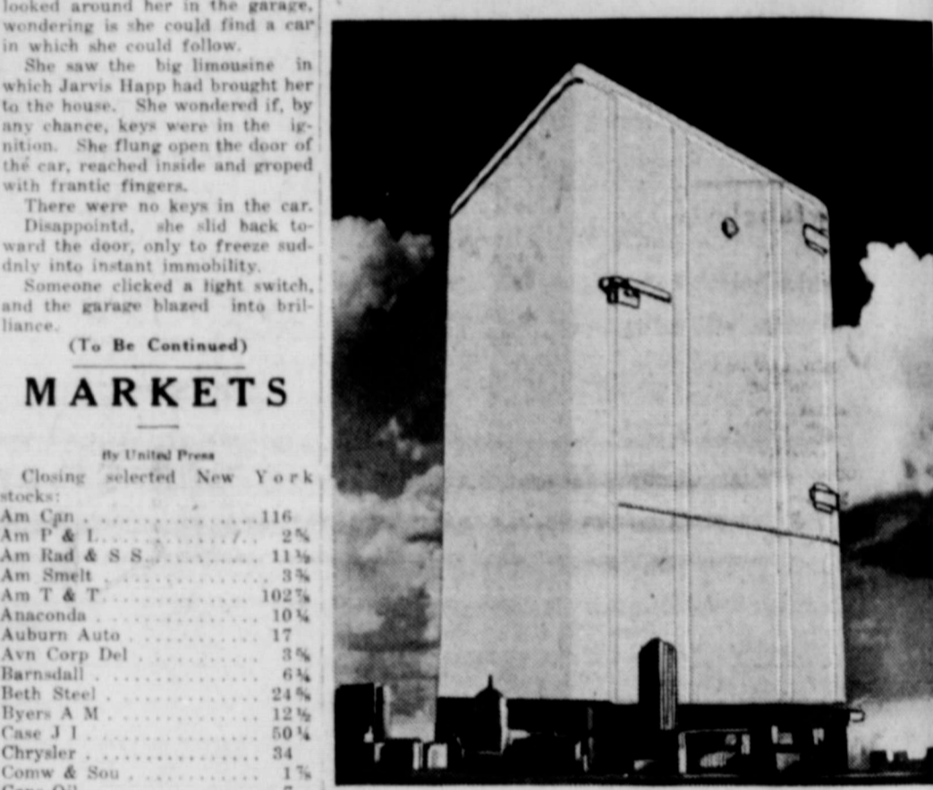
As modern as the skyscrapers. The refrigerator shown above in this unusual photo is built along the latest style lines and offers the utmost in efficiency and performance. It will be featured during Ward Week in Wards 488 stores from Thursday, March 28 to Saturday, April 6 inclusive.