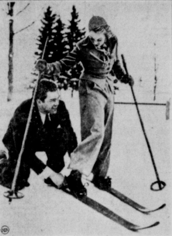
That old Max Schmeling crouch, familiar to ring boys in the United States, is now about and, in its place, is the crouch that Schmeling is displaying above. Der schlagers' movie queen wife, Anny Ondra, is a ski enthusiast, and Max takes care of her on the runners on her shoes. The pair were snapped at Garmisch-Partenkirchen, Bavaria, scene of the 1936 Olympic Winter Games.