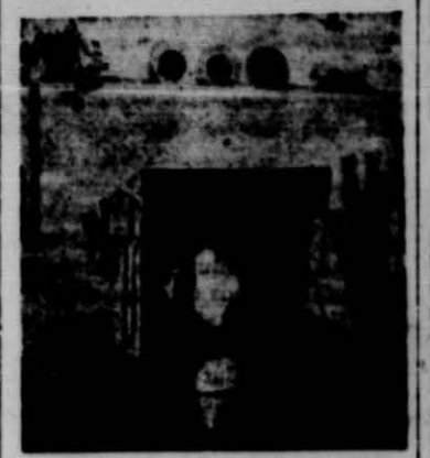
stained copper scrub pan, scar and polish it to the original brightness. Presto, you have a handsome kitchen cabinet.