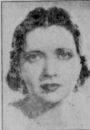
KAY FRANCIS Star of Warner Bros.—First National Pictures.

"A woman is as smart as she feels," asserts Orry-Kelly, and he should know, for it is Orry-Kelly who dresses the famous stars of Warner Brothers—First National Pictures.