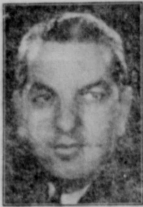
ORRY-KELLY Designer of Fashions for Warner Bros. Pictures.

Says Orry-Kelly Famous Hollywood Designer in the First of a Series of Personal Interviews.