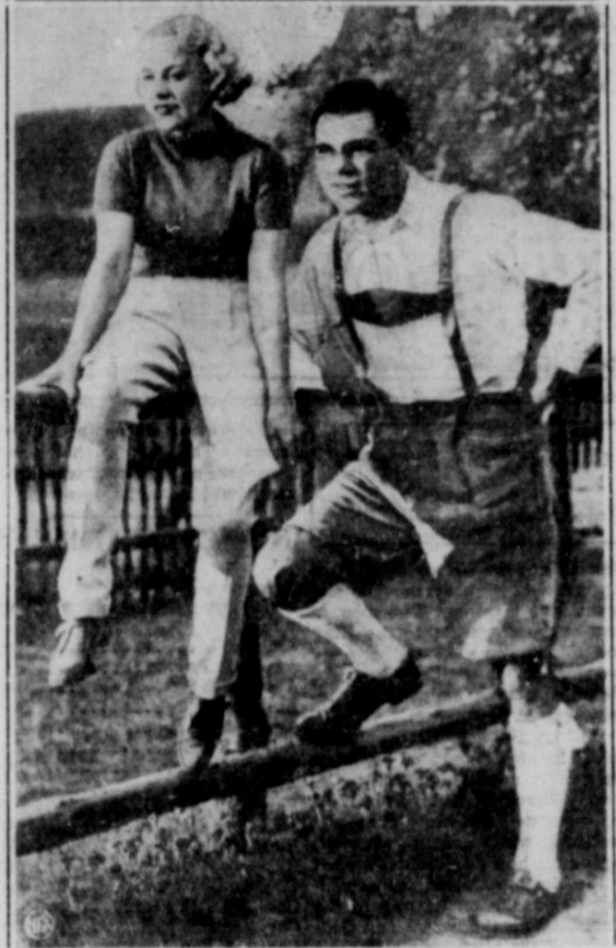
Herr Max Schmeling, former heavyweight champion, has gone native on his German estate, even donning the traditional Bavarian costume to complete his role of country gentleman.