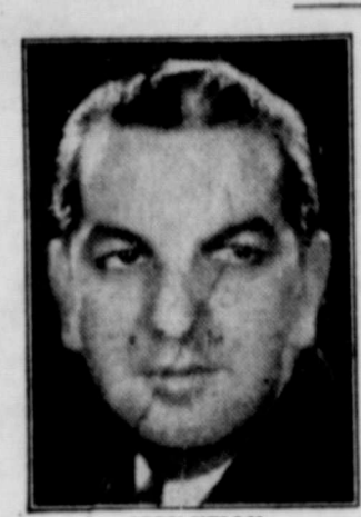
ORRY-KELLY Designer of Fashions for Warner Bros. Pictures

Says Orry-Kelly Famous Hollywood Designer in the Sixth of a Series of Personal Interviews