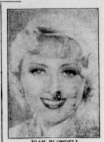
JOAN BLONDELL Star of Warner Bros.—First National Pictures