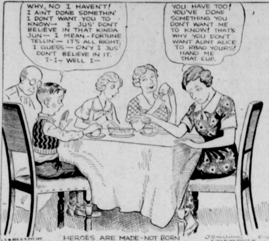
HEROES ARE MADE—NOT BORN