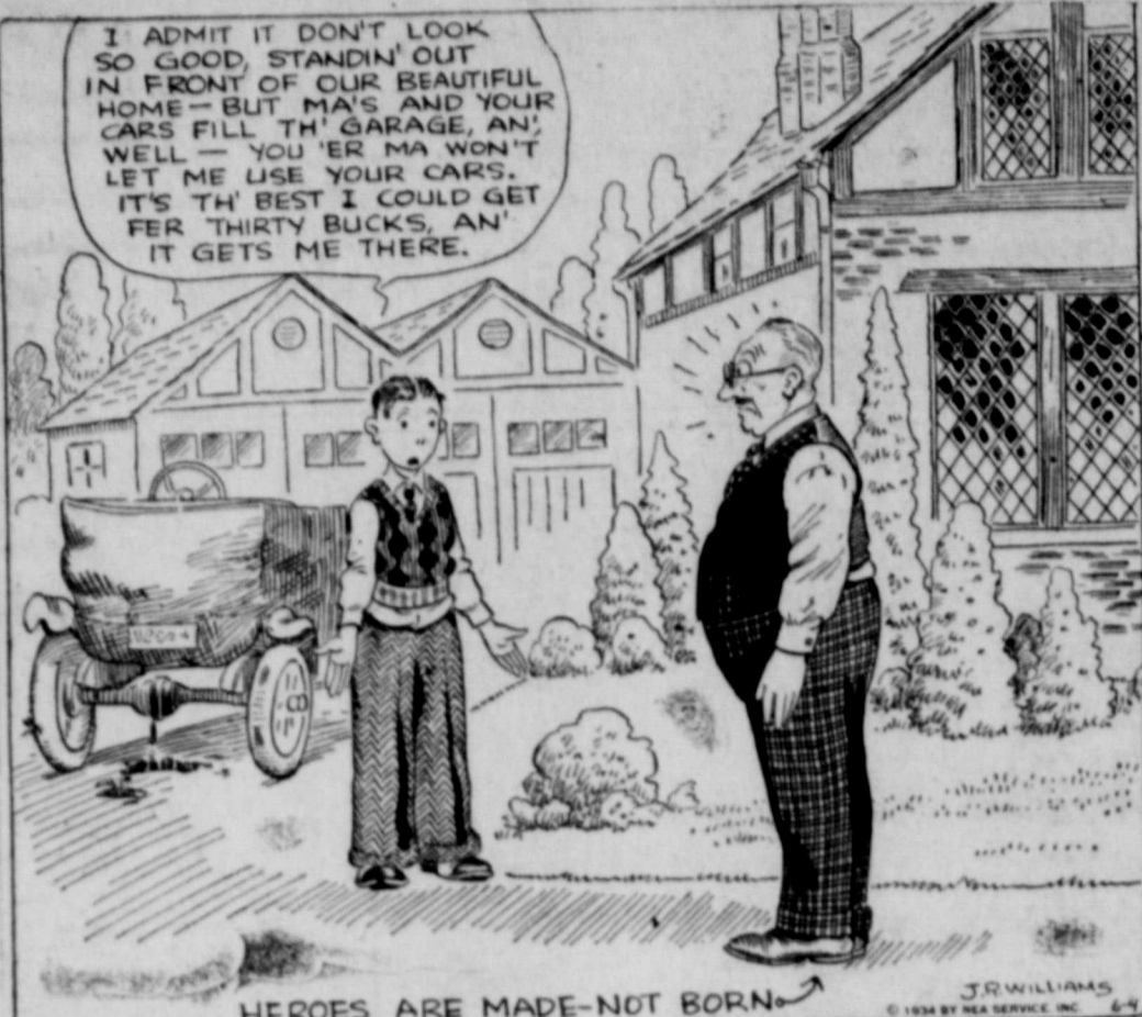
HEROES ARE MADE - NOT BORN