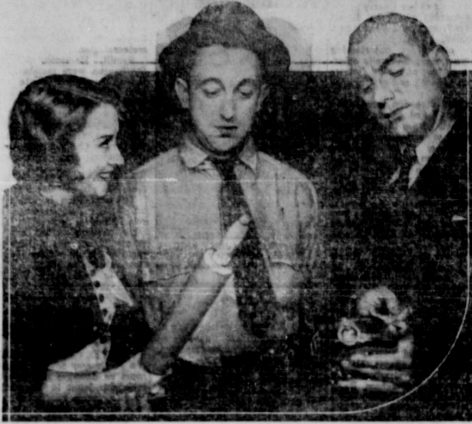
And the honeymoon hasn't even started. Joan Blondell and Pat O'Brien getting set for that leap-into-matrimony, while Allen Jenkins looks on in sympathy...