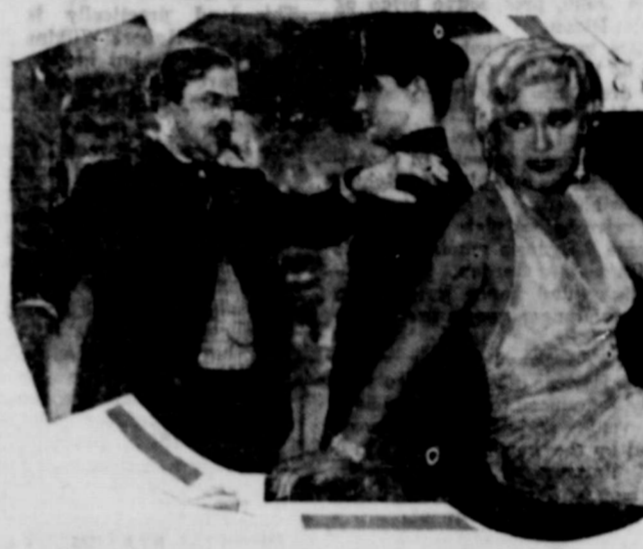
Mae West is that kind of woman, in her first starring picture, "She Done Him Wrong," for which she also provided the story...