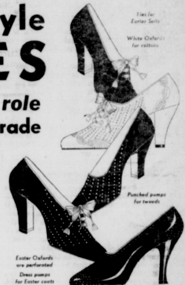
Ties for Easter Suits

They're the last word in style; they're streamlined! The leathers are soft; colors smart; heels correct!