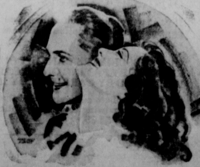
Fredric March and Sylvia Sidney, as the artist caught them, in their latest Paramount picture, "Good Dame," at the Arcadia Theatre. The popular players are co-starred in the H. P. Schulberg production which Marion Gering directed. The cast includes Jack LaRue and Noel Frances.