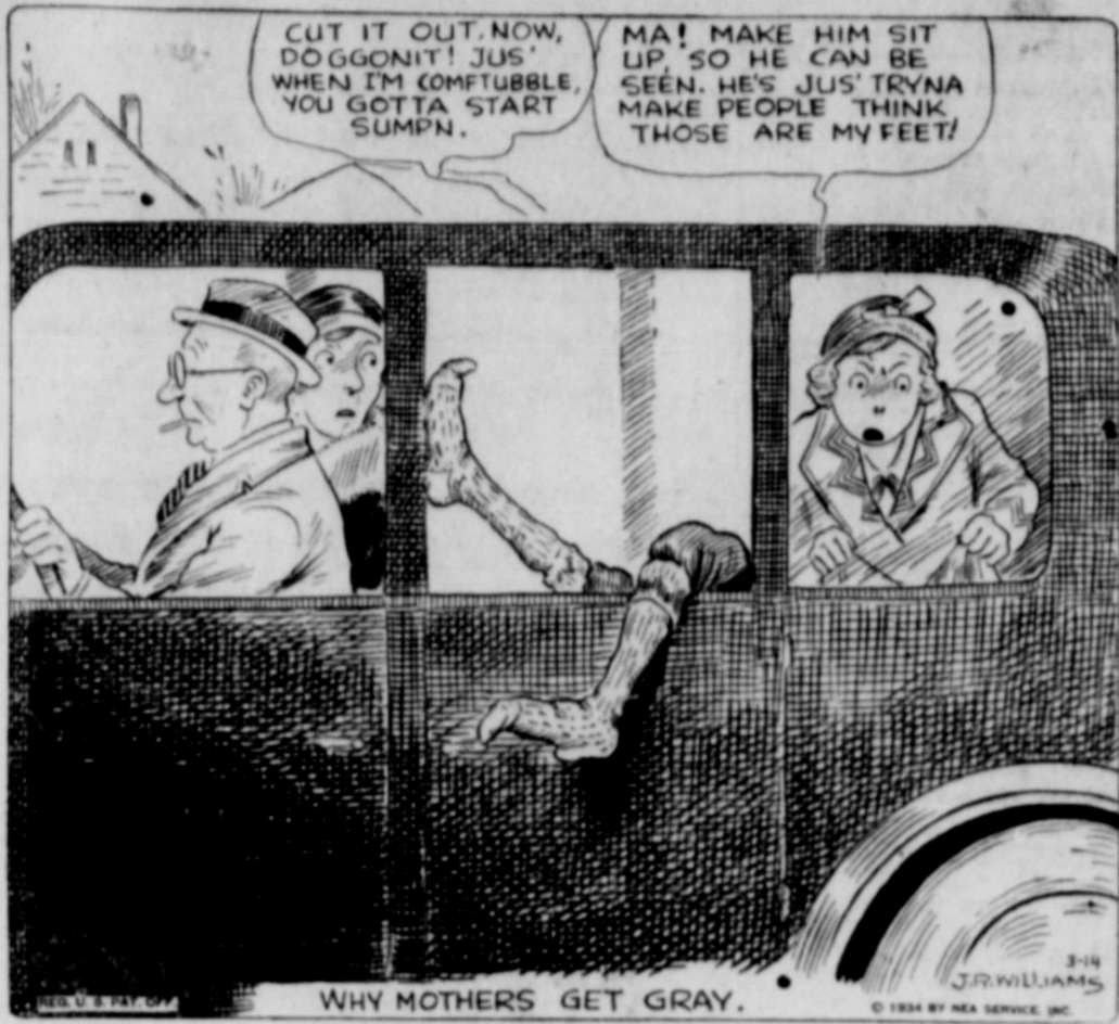
WHY MOTHERS GET GRAY.