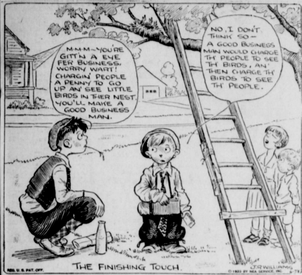
THE FINISHING TOUCH.