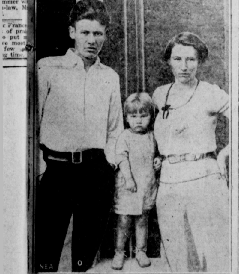
Harvard mother love is believed the motive in the strange kidnaping of baby Sneed...