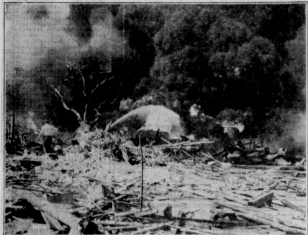
Death and destruction visited Signal Hill, famous oil field at Long Beach, Calif., in the form of an explosion and fire which killed possibly 20 persons and injured many more. The blast, occurring in a gasoline distillery at the edge of the field, started a fire which threatened scores of surrounding producer wells. Bird's-eye view photo, taken from atop a nearby derrick, shows the fire raging after the blast. In the foreground can be seen the manner in which the explosion wrecked buildings and tore metal sheeting from the oil derricks.