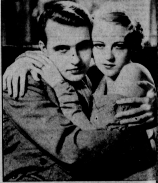
Sally Eilers and Ralph Bellamy are cast as the representatives of different social strata in the new Fox screen play "Second Hand Wife," dramatized from the novel by Kathleen Norris.