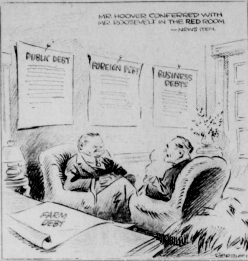
MR. HOOVER CONFERRED WITH MR. ROOSEVELT IN THE RED ROOM. —NEWS ITEM.