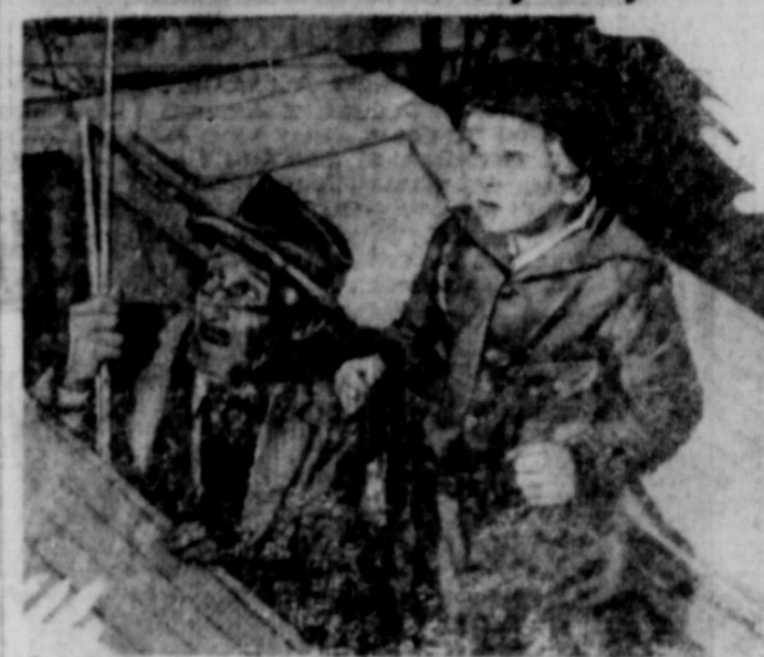
"CHIC" SALE and JACKIE COOPER in WHEN A FELLER NEEDS A FRIEND