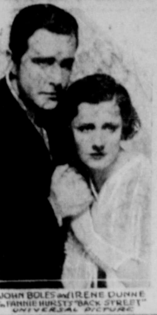
JOHN BOLES and IRENE DUNNE in "BACK STREET" at the Arcadia Theatre.