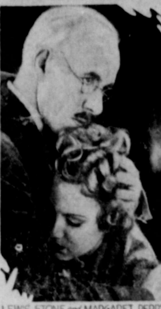
LEWIS STONE and MARGARET PERRY in "NEW MORALS FOR OLD" Tuesday and Wednesday