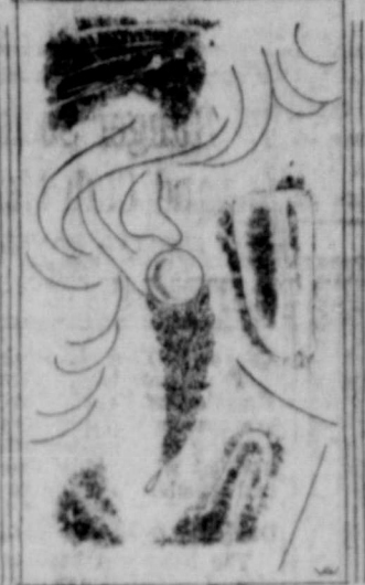
NEW EARRINGS of maracite and a large pearl take to wisps.