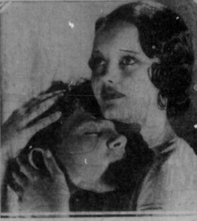
Eric Linden and Rochelle Hudson, who head a cast of youthful players in "Are These Our Children?" at the Columbia theatre. These newcomers are said to deliver two of the year's most notable performances.