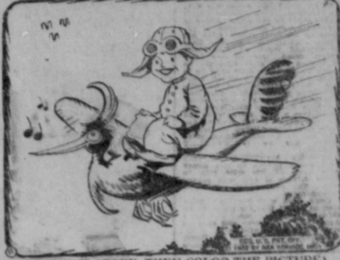
(READ THE STORY, THEN COLOR THE PICTURE)

FAT Jumpjump was having fun. My goodness, how the bird could read! The Timmies watched him as he zoomed on very tight. The zoo man shouted, "Don't let go, or you will tumble off, I know, as long as you cling to the bird's long neck you'll be all right."