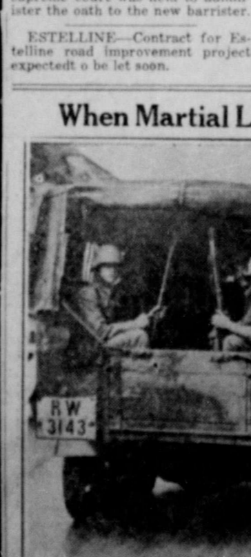
Demonstrations and riot during the political campaign prior to the German Reichstag election brought martial law to Berlin and the province of Brandenburg. Here you see an army truck occupied by soldiers of the Reichswehr in front of the German Foreign Office. The edict made Chancellor Von Papen a Federal dictator of Prussia.