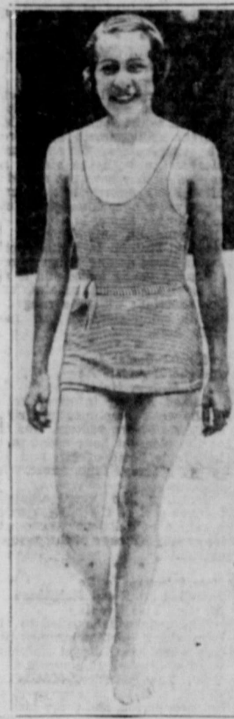
The beauty queen of the Olympics, Eleanor Holm of New York City. A star of the high-diving board, Miss Holm declined a place in the Follies to take part in the games.