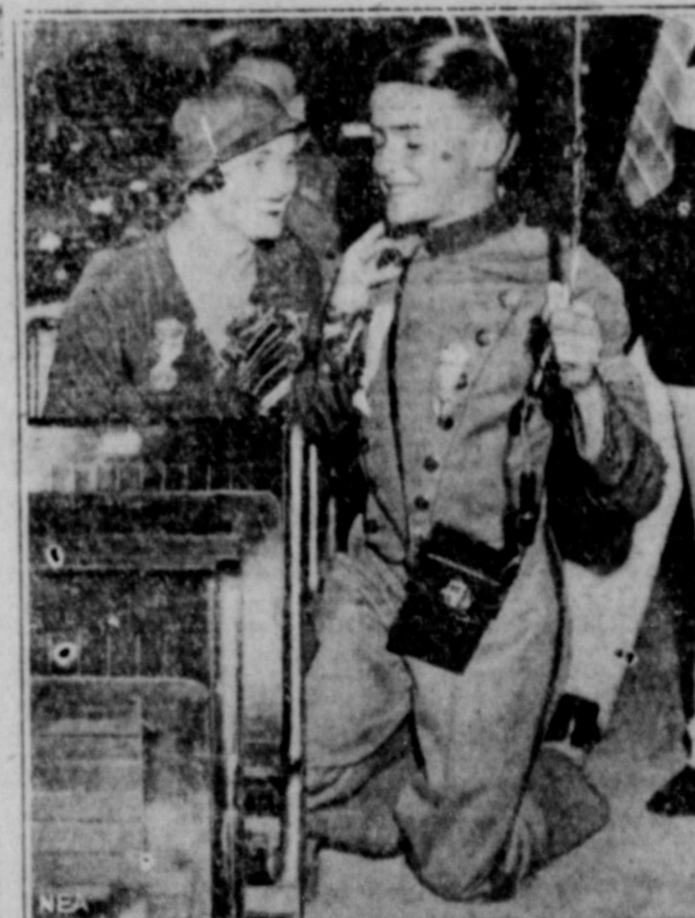
Here's how delegates to the Democratic National Convention made their voices heard in great Chicago Stadium...