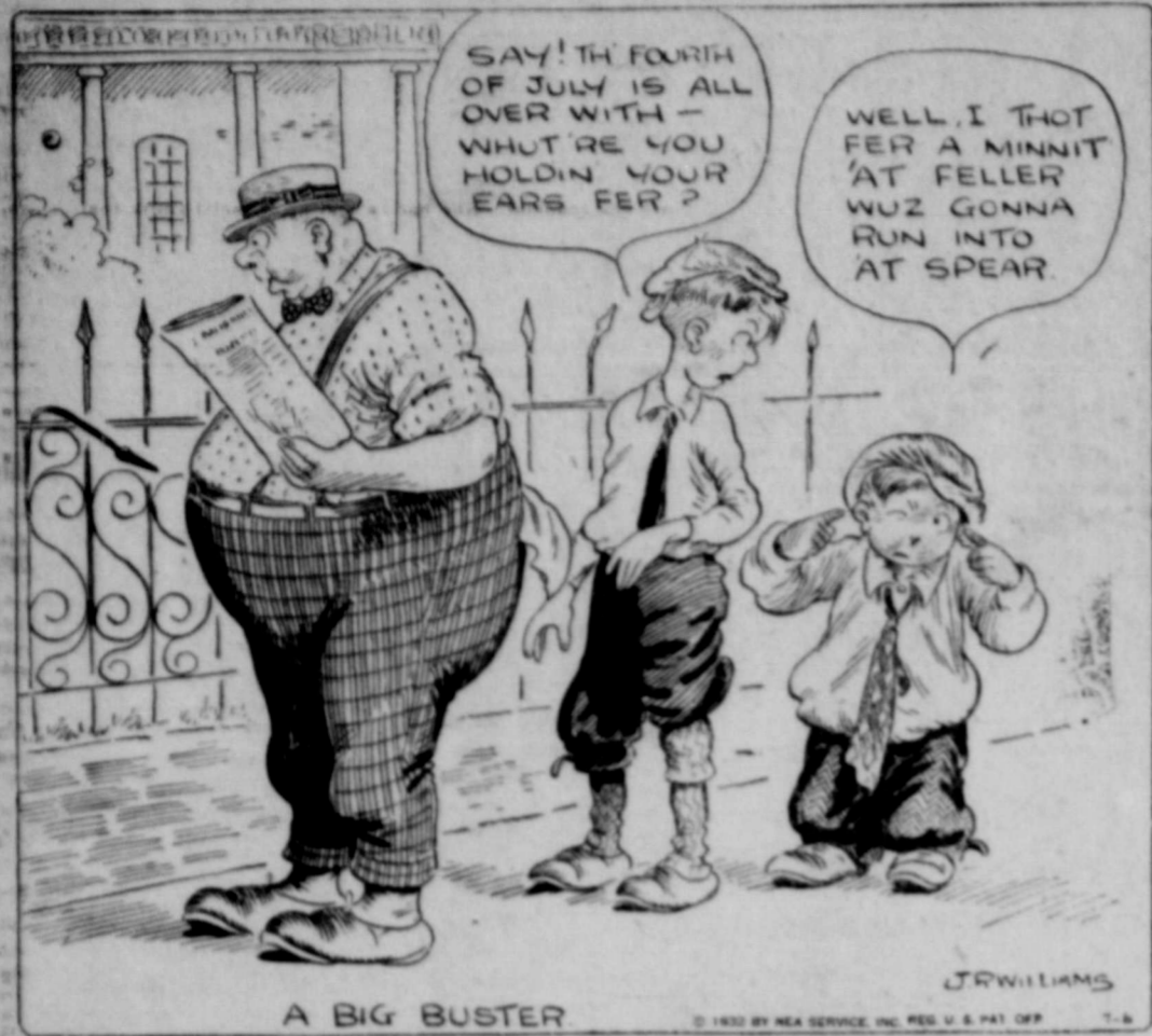
A BIG BUSTER