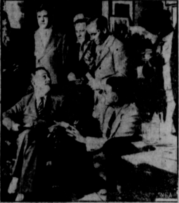
The world of victory from the Chicago arena found the Democratic presidential nominee in the spacious drawing room of the governor's mansion at Albany. Here is Governor Roosevelt, surrounded by newspapermen, as he flashed his famous smile and said, "I am very happy."