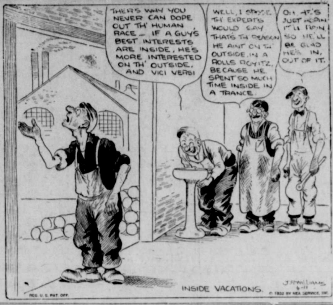
INSIDE VACATIONS. J.P. LANE. © 1932 BY NEA SERVICE, INC.