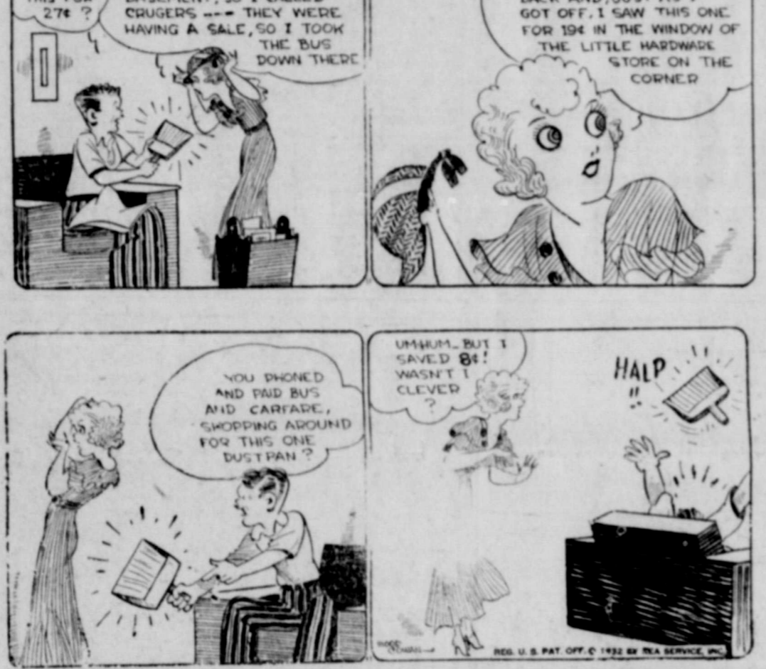
REG. U. S. PAT. OFF. © 1932 BY NEA SERVICE, INC.