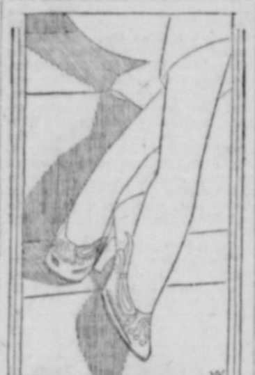
THESE BROWN kid pumps, forecast as a popular model for the coming season have a cut-out nose at the side and a trim of perforations on the vamp.