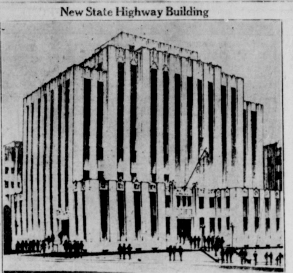
This design for the eight-story state highway building at Austin has been approved by the highway commission, and detailed plans are being completed for award of a contract probably in January. The building is to cost $500,000, and will be paid for from highway funds.