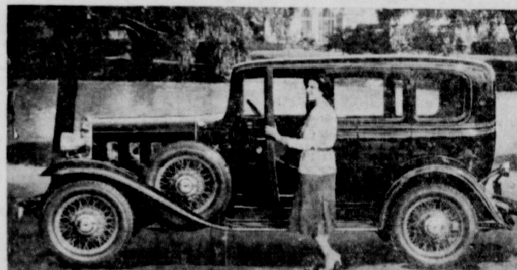
Above: Special Sedan Right: Head-on View