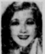
Sweet-faced little Helen Twelvetrees is another stage youngster who rocketed to Hollywood glory in a picture or two. If that girl's disposition could be photographed it would be a lesson in charm. An RKO-Pathé star, Helen will soon appear in "Pick-Up."

Made of the finest tobaccos — The Cream of many Crops — LUCKY STRIKE alone offers the throat protection of the exclusive "TOASTING" Process which includes the use of modern Ultra Violet Rays — the process that expels certain harsh, biting irritants naturally present in every tobacco leaf. These expelled irritants are not present in your LUCKY STRIKE. "They're out — so they can't be in!" No wonder LUCKIES are always kind to your throat.