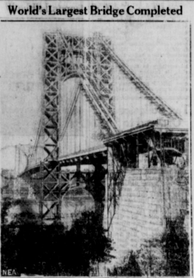
World's Largest Bridge Completed Ready for use after four and a half years of record-breaking construction, the George Washington Bridge here is pictured as it now spans the Hudson River between upper Manhattan and northern New Jersey. The structure cost $400,000,000 and its central span is 3500 feet in length.

PAPERS BID ON STORY OF MRS. JUDD By United Press. LOS ANGELES, Oct. 27.—Spirited bidding for the story of Mrs. Vinnie Ruth Judd, on the part of real newspapers today shared interest with the possibility that she might become a mother and in that summer beat the galleons.