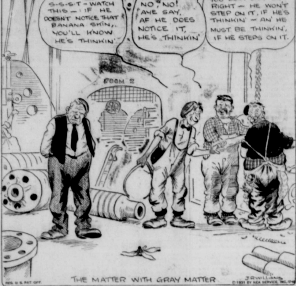
THE MATTER WITH GRAY MATTER