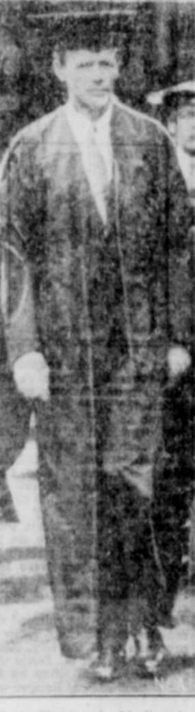
Colonel Charles A. Lindbergh is now a master of science, having been honored at the graduation ceremonies of Princeton University. Here he is in his cap and gown.