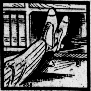
FOOT EASE WILL PLEASE.

The latest style coupled with perfect comfort will make the purchase of footwear from us a genuine pleasure!