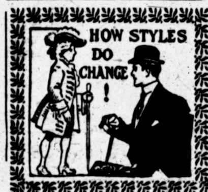
IT WOULD EMBARRASS YOU

to be compelled to wear clothes that were "in style" 100 years ago.