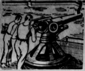
Our boys are defending this country on the high seas and on the land.

Our own defense against a common enemy is to keep the system clean by ridding the body of the toxins, or poisons, which are bred in the intestines. When you feel tired, sleepy, headachy, when your breath is offensive, or pimples appear on the face and neck, it is time to recognize the danger and protect your bodily health by taking something for the liver such as Dr. Pierce's Pleasant Pellets.