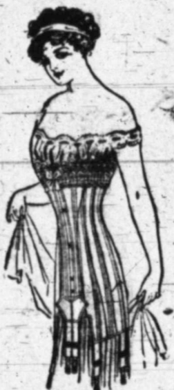
HENDERSON Fashion Form Corsets

Visit our corset department and let our corsetieres explain and show you the many advantages of wearing Henderson Corsets .