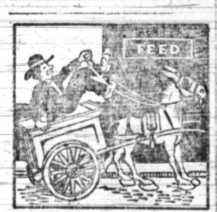
EVEN THE MULE KNOWS

where the best feed comes from. The best way, to got them by our store is