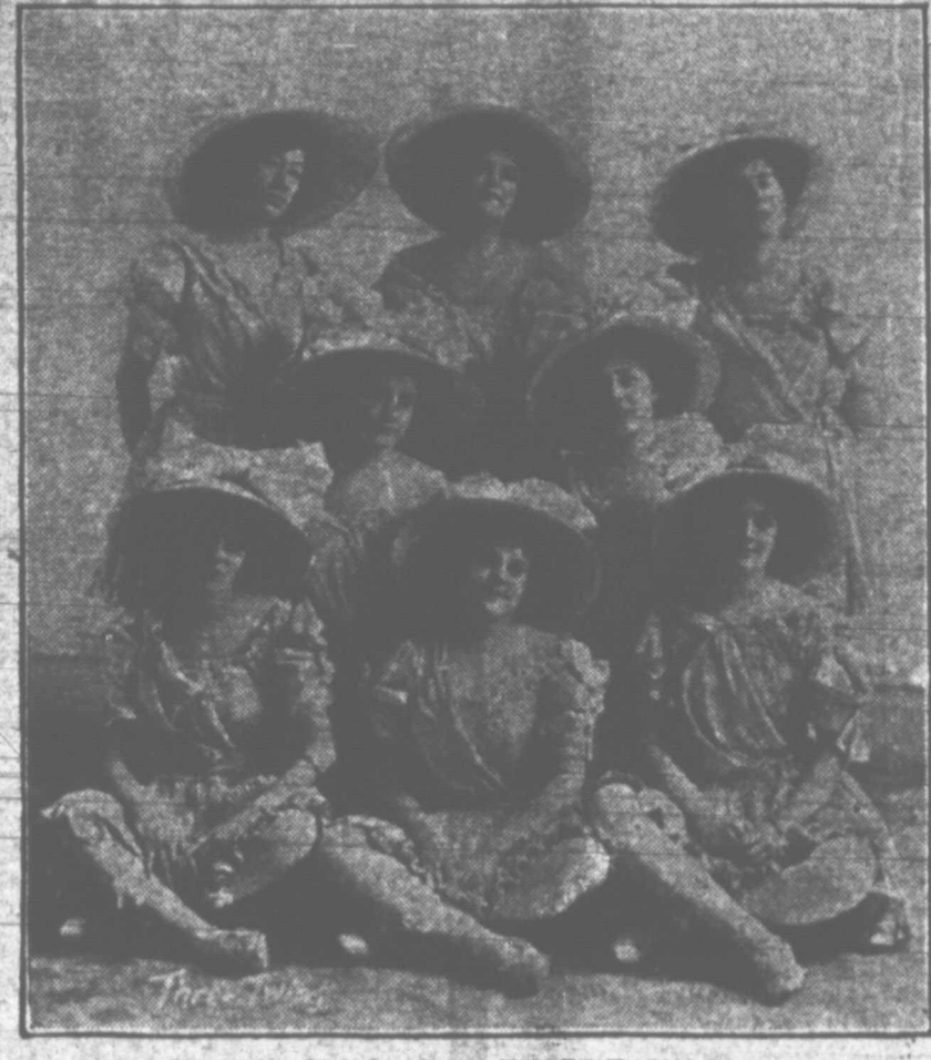
Bathing Girls in 'THE THREE TWINS."