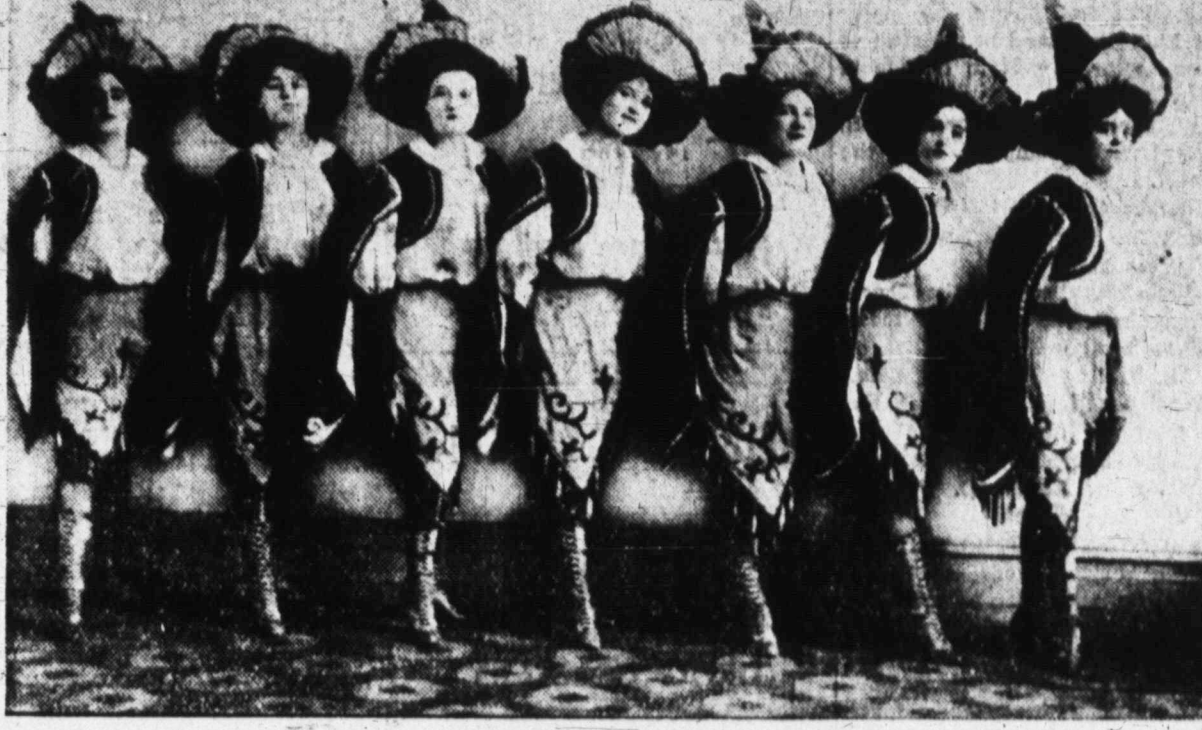
FILLIE CHORUS WITH "THE GIRL QUESTION."