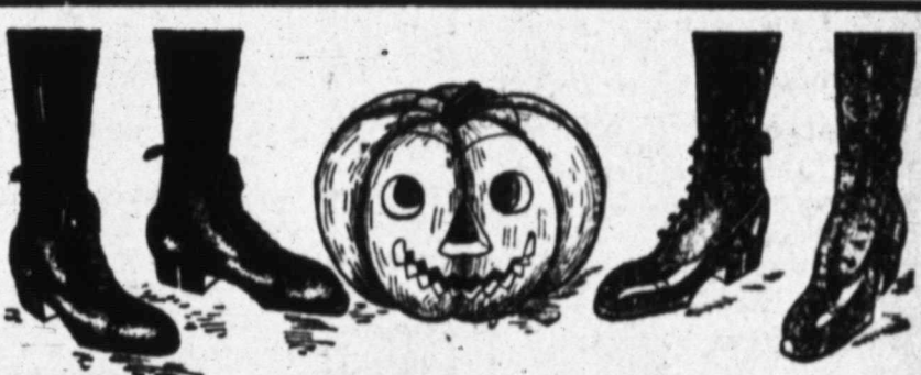
No. 27