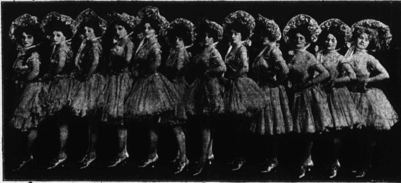
A DOZEN OF THE 'DAINTY MAIDS' WITH TOO MANY WIVES.