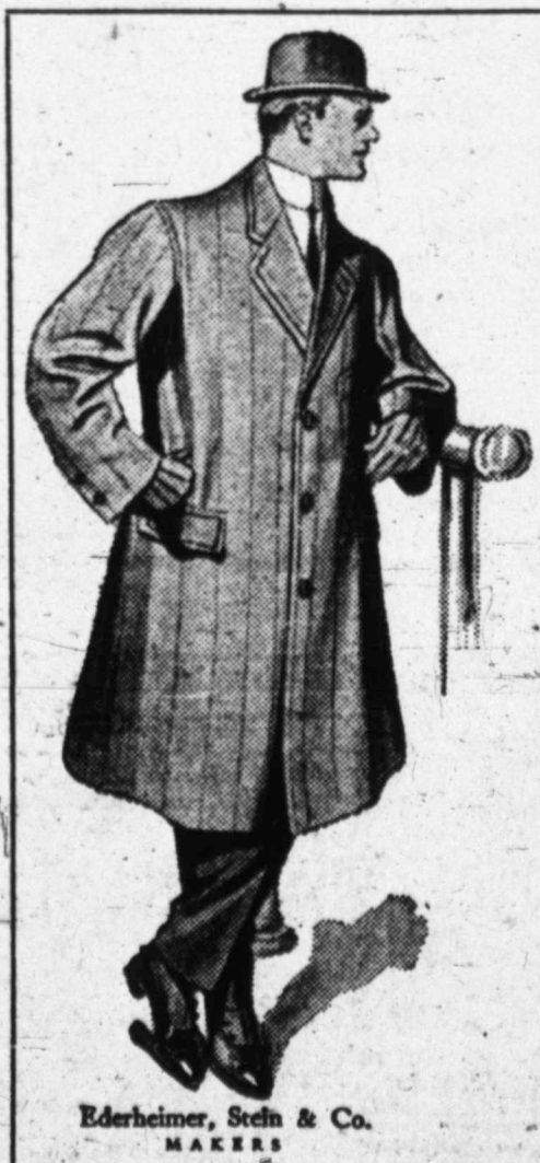
Ederheimer, Steh & Co. MAKERS

The volume of business this store has acquired, makes possible the two most vital considerations uppermost in every prospective buyer's mind; namely, assortment for selection and greatest value for the price paid.