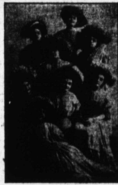
GROUP OF "BEAUTY CHORUS," IN "A KNIGHT FOR A DAY."

Coming: November 20--"The Man of the Hour"