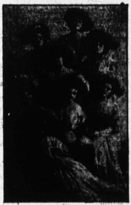
GROUP OF "BEAUTY CHORUS," IN "A KNIGHT FOR A DAY."

Seat Sale Opens Tomorrow. Prices: 25c, 75c, $1.00 and $1.50