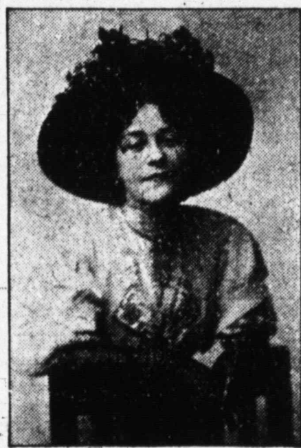
GRACE DE MAR, in "A Knight for a Day."