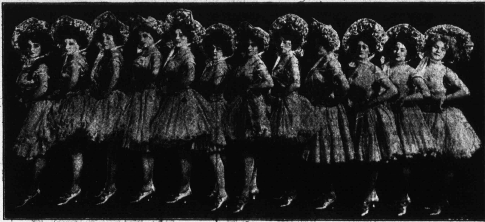
A DOZEN OF THE "DAINTY MAIDS" WITH TOO MANY WIVES."