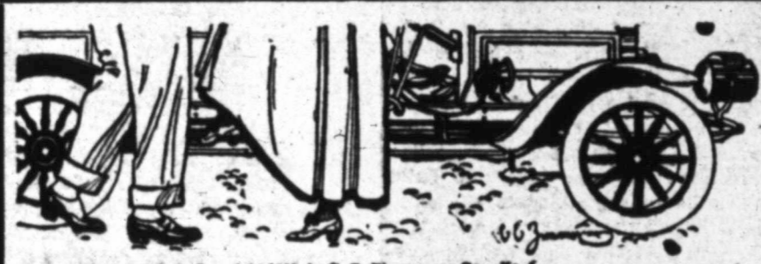
No. 4