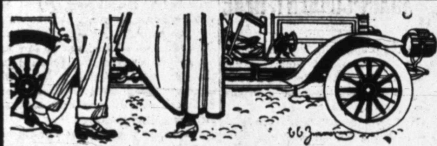
Copyright 1909, by C. E. Zimmerman Co.--No. 6