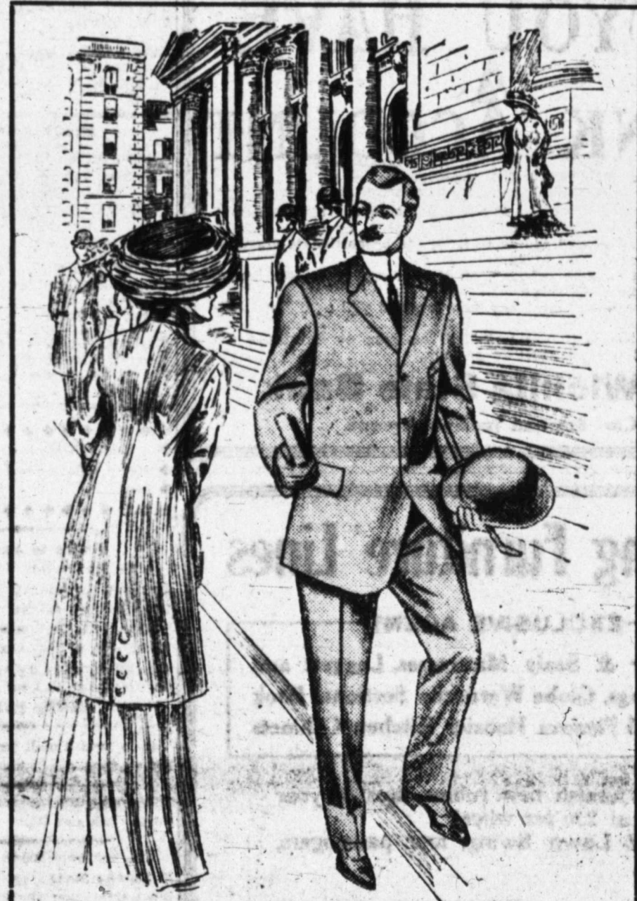
Benjamin Clothes Alfred Benjamin & Co.

The manufacture of tin plates originated in Bohemia about before 1600.