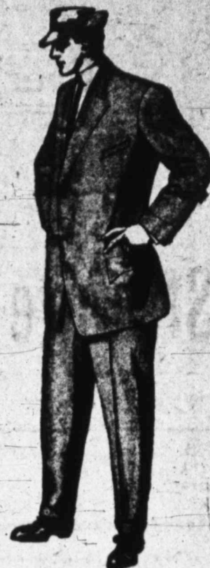
Copyright 1909 The House of Kuppenheimer Chicago

See that the coat bears the Kuppenheimer label; In that you are sure of getting good clothes. Don't buy the suit or overcoat by look alone for the important parts are hidden.