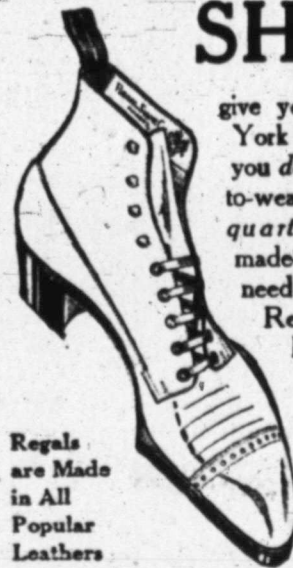
Regals are Made in All Popular Leathers

give you the latest New York custom styles—which you don't get in other ready-to-wear shoes. And Regal quarter-sizes afford you made-to-measure fit. No need to tell you about Regal quality—everyone knows it is standard.