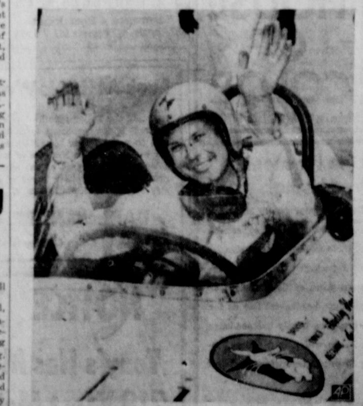
AFTER FAST RUN —Houston, Texas race driver Lloyd Ruby waves happily to crowd after he qualified for the Indianapolis, Ind. 500-mile auto race. Ruby, driving the late Tony Bettenhausen's Auto Lite Special, averaged 146.909. It was the third fastest qualifying run in the Speedway history.